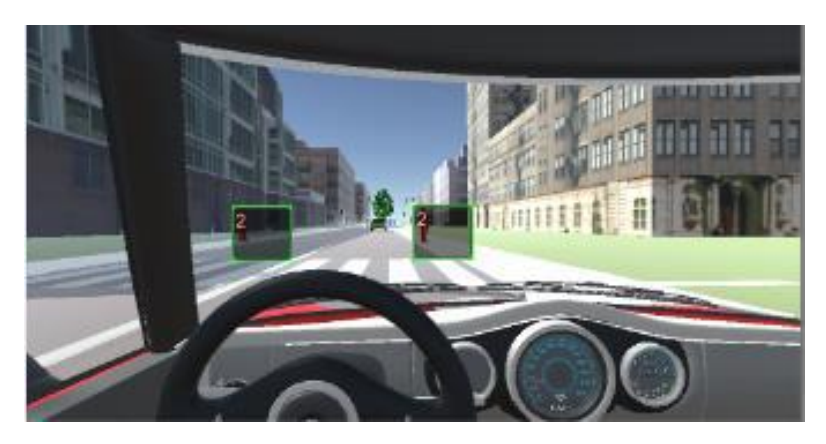
Fig. 3. Example of pedestrians' detection by using an object-bounding box.

The above describe strategy has been proved to be effective to establish the bidirectional communication between the pedestrians and the vehicles in the surroundings.